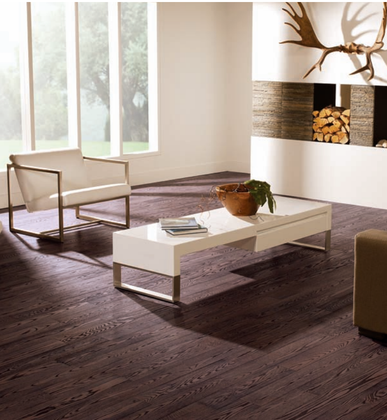
Red Oak, Wire-scraped™ Serengeti, 5", Original™ Series