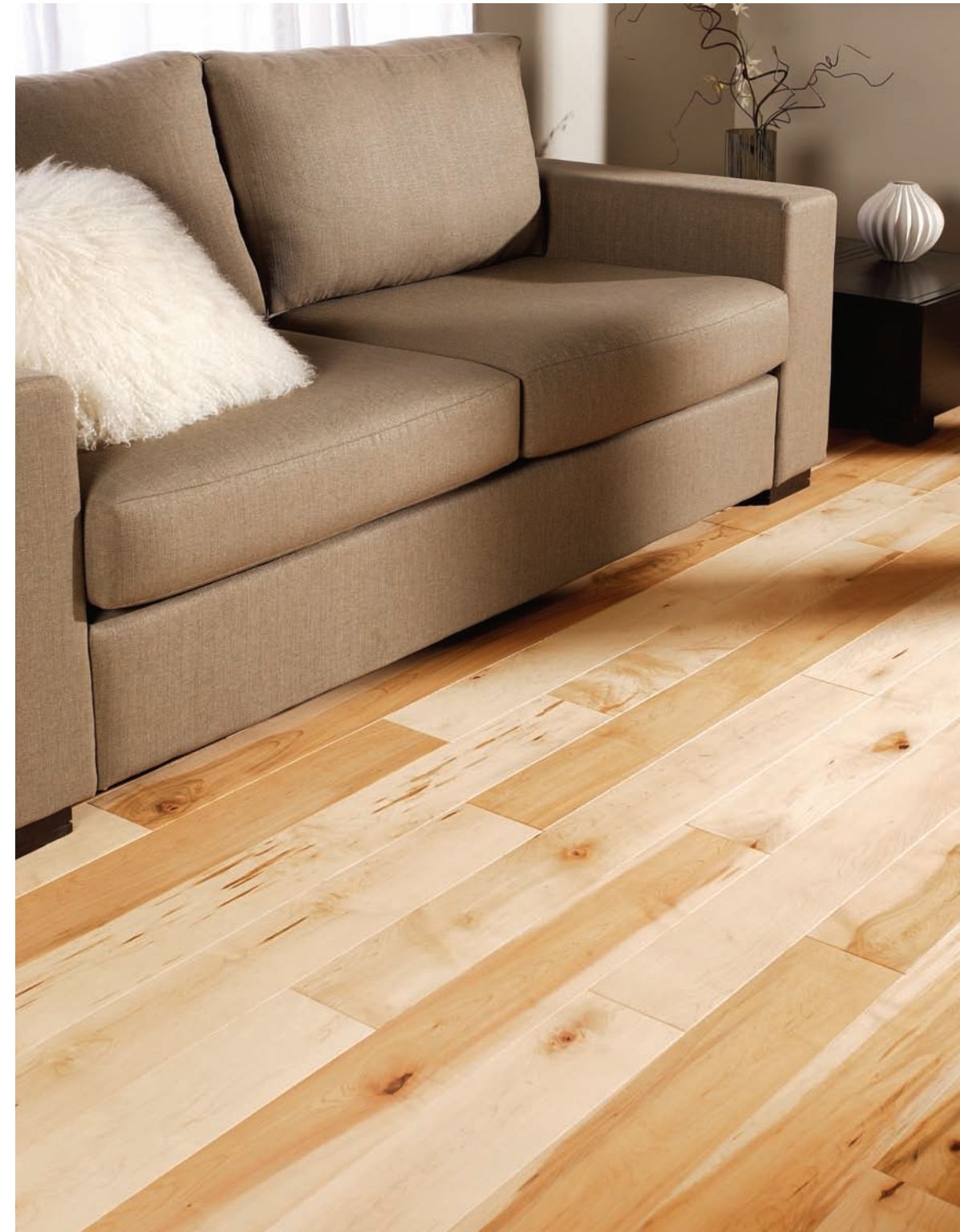
Character, Hard Maple, 5", Original™ Series