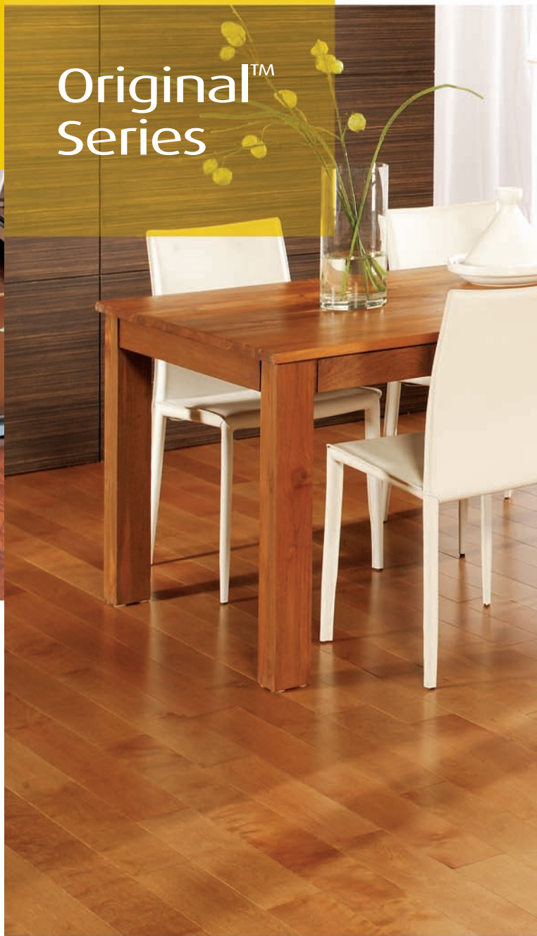
Ash, Select Extra 3 1/4", Original™ Series