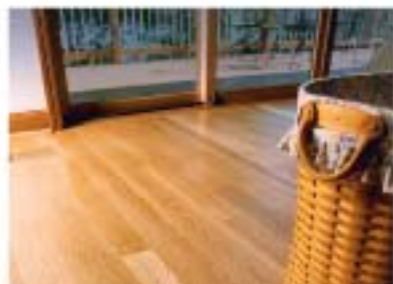
White Oak - Select (3", 4" & 5" Pattern)