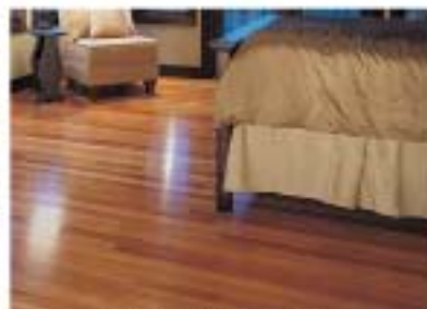
3" Eucalyptus - Select